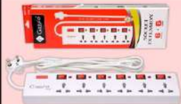
MODEL NO. 6630 = 6+6 3Y MODEL NO. 6650 = 6+6 5Y

EXTENSION STRIP & CONVERSION PLUG ALWAYS AHEAD IN QUALITY