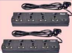
MODEL NO. 020 4+4 (2Y/5Y)