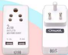
MODEL NO. ACTIVA 2USB OUTLET POWER SOCKET