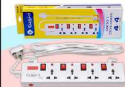
MODEL NO. 4430 = 4+4 3Y MODEL NO. 4450 = 4+4 5Y