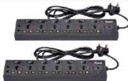
MODEL NO. 022 6+6 (2Y/5Y)