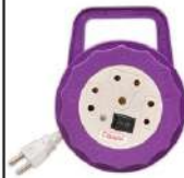
BALENO (POUCH PKG.)