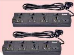
MODEL NO. 020 4+4 (2Y/5Y)