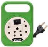
NANO HD - 13