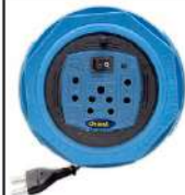
HD - 14 (LONG)