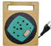
HD - 13