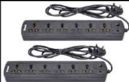
MODEL NO. 023 6+1 (2Y/5Y)