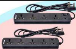
MODEL NO. 017 4+1 (2Y/5Y)