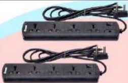
MODEL NO. 017 4+1 (2Y/5Y)