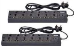
MODEL NO. 022 6+6 (2Y/5Y)