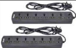
MODEL NO. 023 6+1 (2Y/5Y)